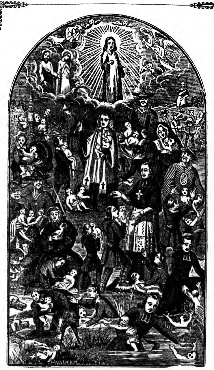
SAVE US, FOR WE PERISH.