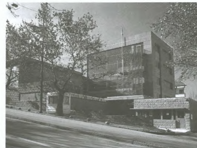
Canada's new embassy in Ankara

The Turkish health care sector, with the aid of World Bank financing, is undergoing dramatic restructuring. Turkey is an attractive market for exporters of medical equipment and supplies such as cancer therapy equipment, orthopaedic implants and appliances, x-ray devices and pharmaceuticals, as well as consulting services and knowledge transfer through joint venture or licensing agreements. The Turkish Ministry of Health is the largest single buyer of medical products. Other potential buyers of high-tech equipment and products include private clinics, hospitals and diagnostic labs.