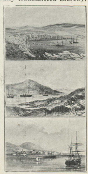
1 Laying Shore end at Valentia. 2 Bantry Bay, Ireland 3 Valentia, Ireland.

The first cable laid in America was laid between Cape Traverse, P. E. Island, and Cape Tormen-