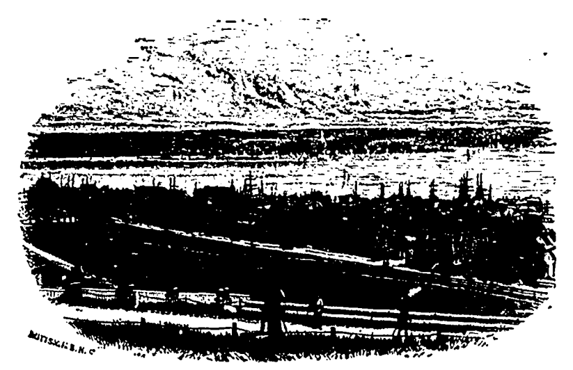
CITY OF HALIFAX.

were many of his personal friends, he determined to remove thither, and on Nov. 1st, 1783, he resigned, and sailed for England shortly afterwards.