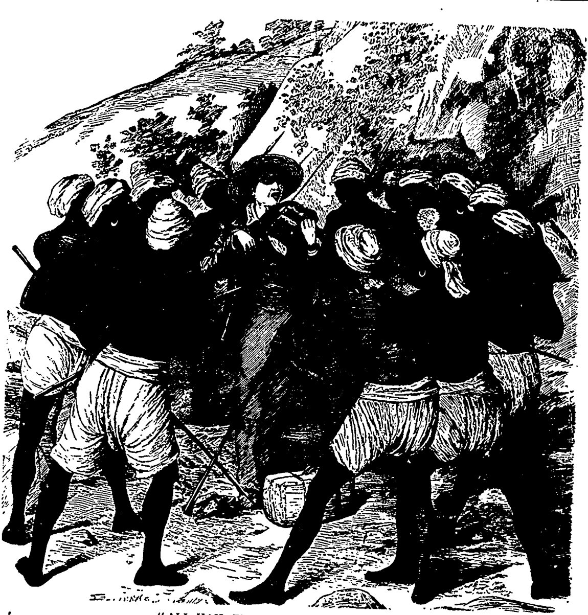
"ALL HAIL THE POWER OF JESUS' NAME."