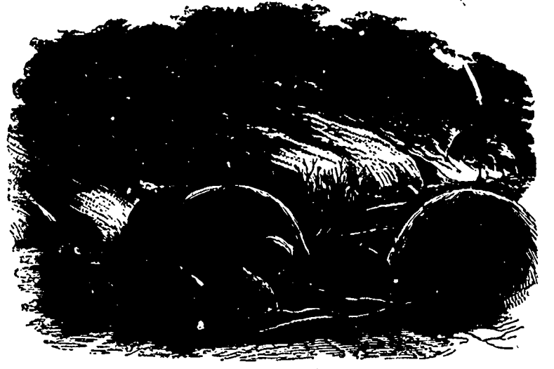
A BURNING KRAAL.