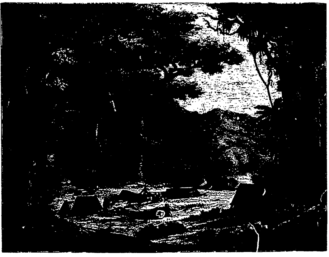
GATHERING PERUVIAN BARK.

conciled to God, and some ministers are much more noted for collections than they are for conversions.