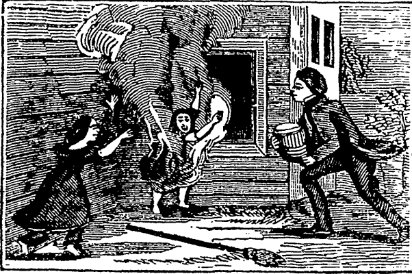
Effects of Drunkenness.

In this picture is represented a most distressing scene. An intemperate mother, living in Johnston, R. I., left her two little girls alone while she went to get her bottle filled with rum. While playing near the hearth, the clothes of the youngest took fire, and, not knowing what to do, she, with her sister, ran out into the street. She was seen by a neighbor, who ran with a bucket of water, and extinguished the flames. But it was too late. She was so badly burned that she lived but a few hours.