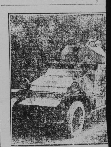
Belgian Army, Newly Equipped, Re First official Belgium photographs to a equipment of the Belgian army in pro-ch will be launched shortly. Photo si