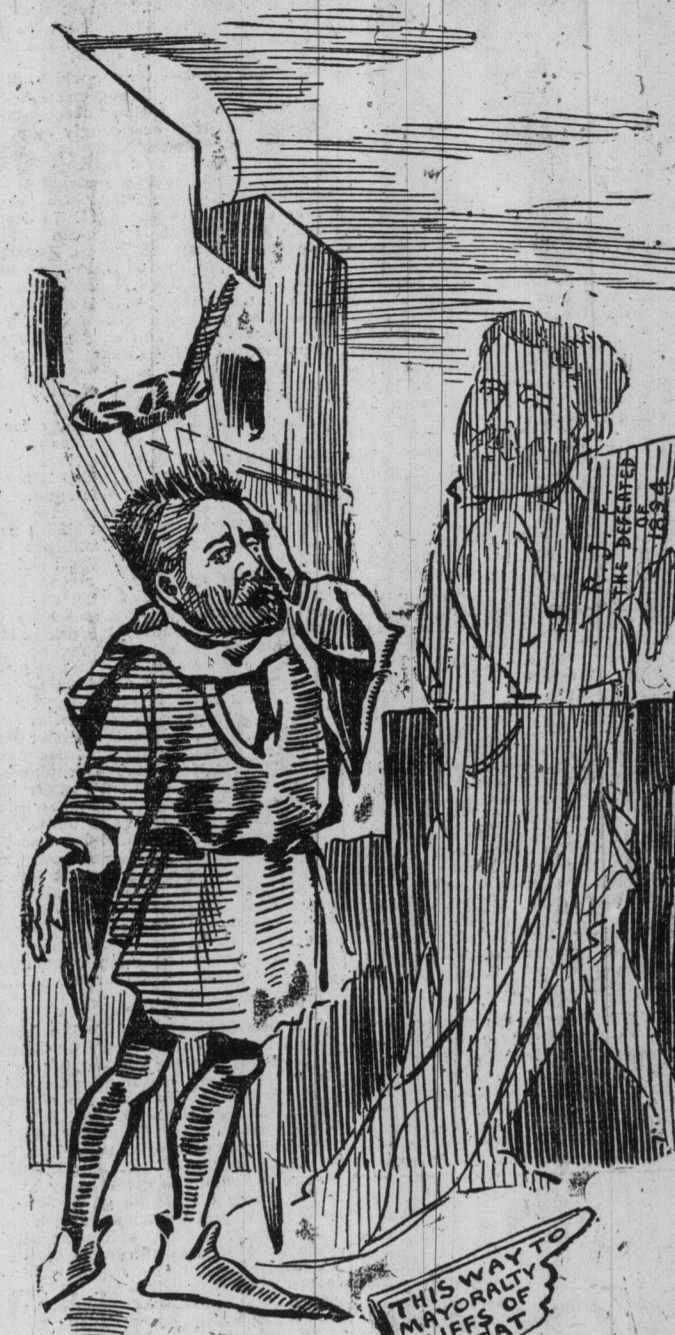
HE FRAUDED THE A.O.F. AN UNWILLING HAMLET.

AN UNWILLING HAMLET. A FRENCH OFFICER DEGRADED. Convicted of Furnishing Germany With Plans of French Forts.