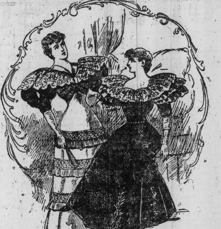
Evening gowns of black velvet and of pink satin and lace.