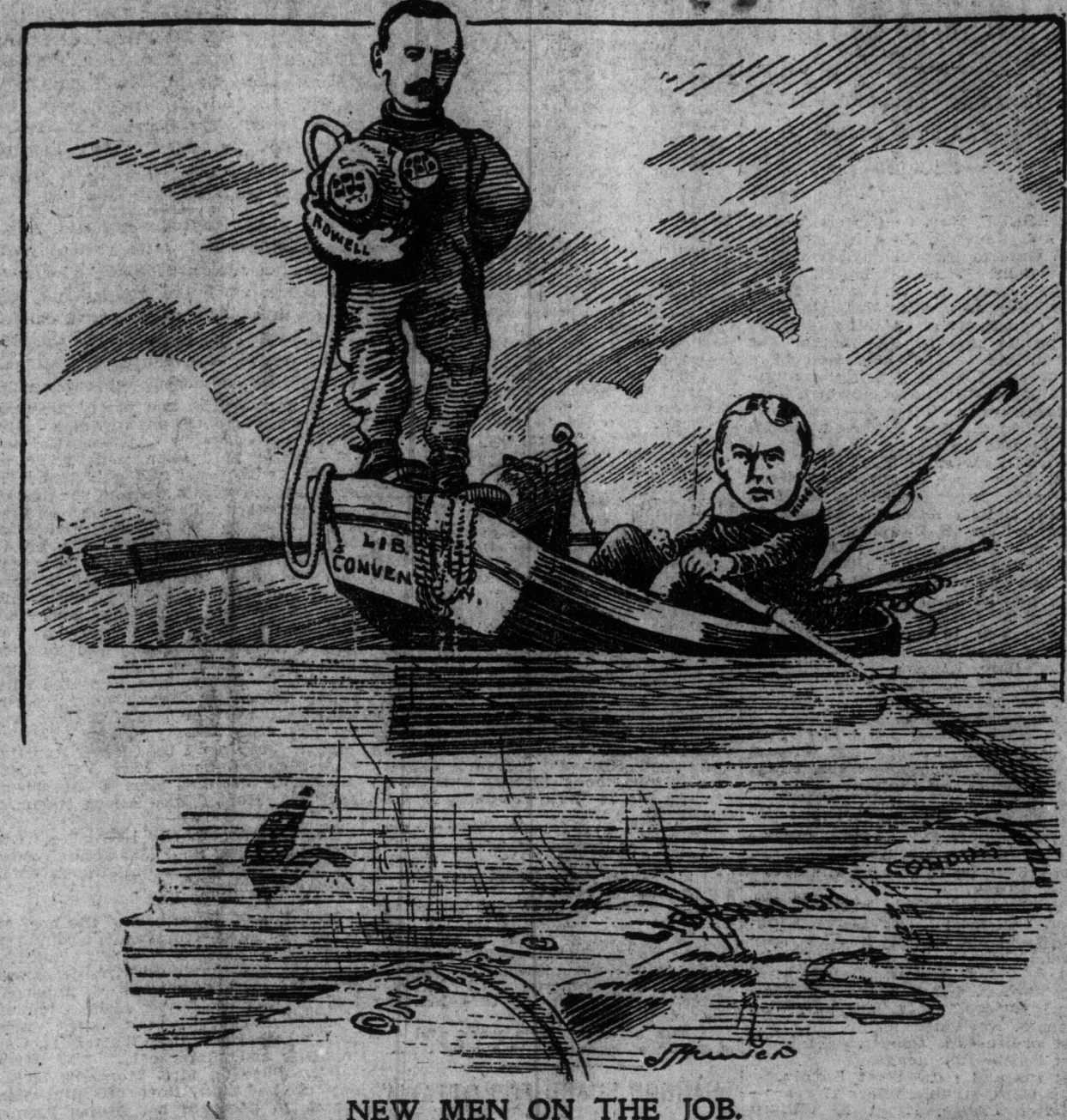
NEW MEN ON THE JOB.