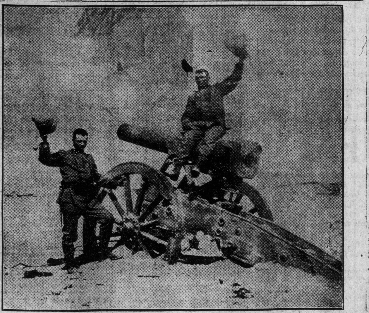
This picture shows the ruins of the old Howitzer of Sultana Fort. This was the principal gun in the fort and was the first to be disabled when the Italians began firing.