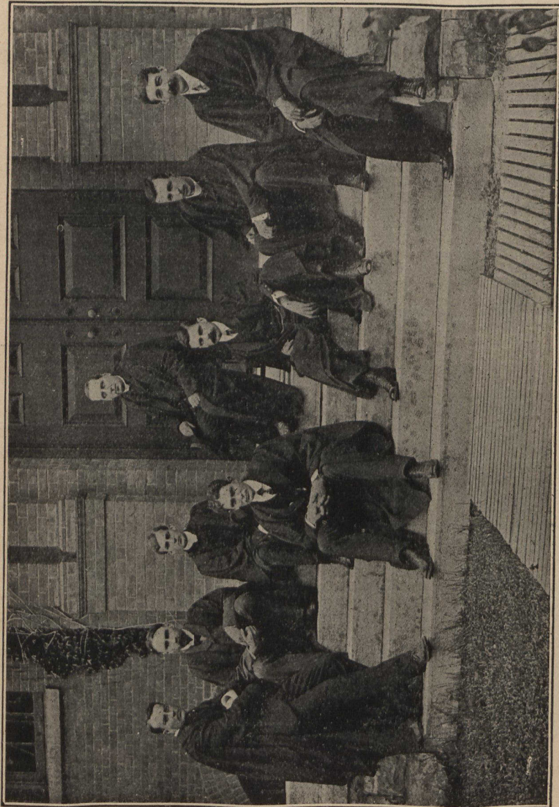
PHOTO OF THE STAFF, JUNE, 1904.