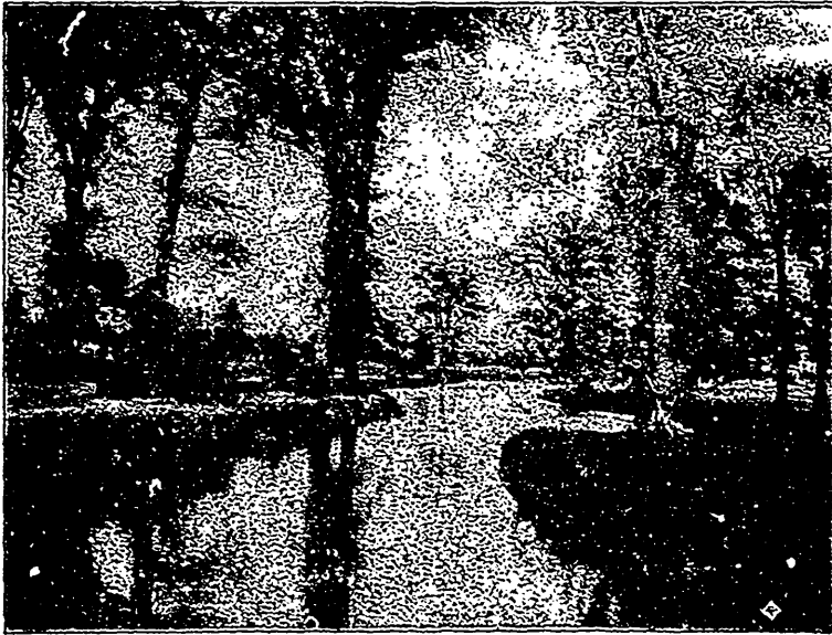
A GLIMPSE OF VICTORIA PARK, BERLIN, ONT.

Canada's Only Weekly Stamp Paper. Published at Berlin, Ont.