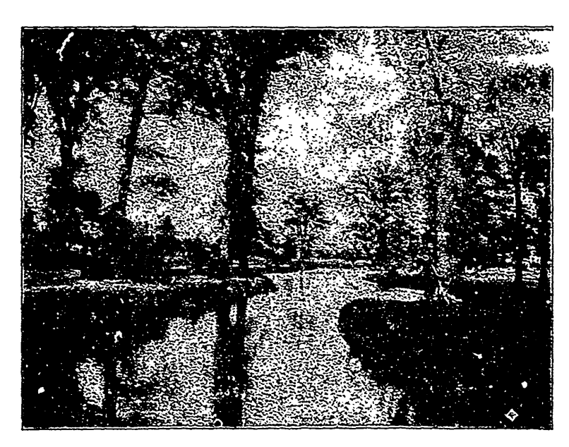
A GLIMPSE OF VICTORIA PARK, BERLIN, ONT.

Canada's Orly Weekly Stamp Paper. Published at Berlin, Ont.