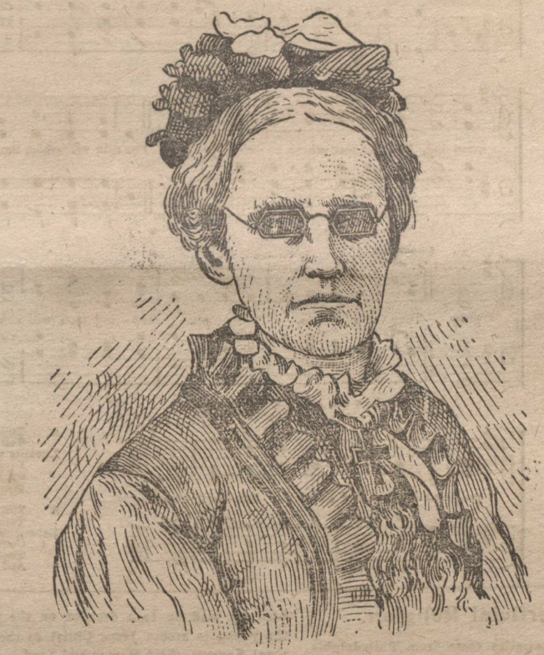
Life of World-wide Service.

They shook hands upon it, the two men who had been spared.—'The British Weekly.'