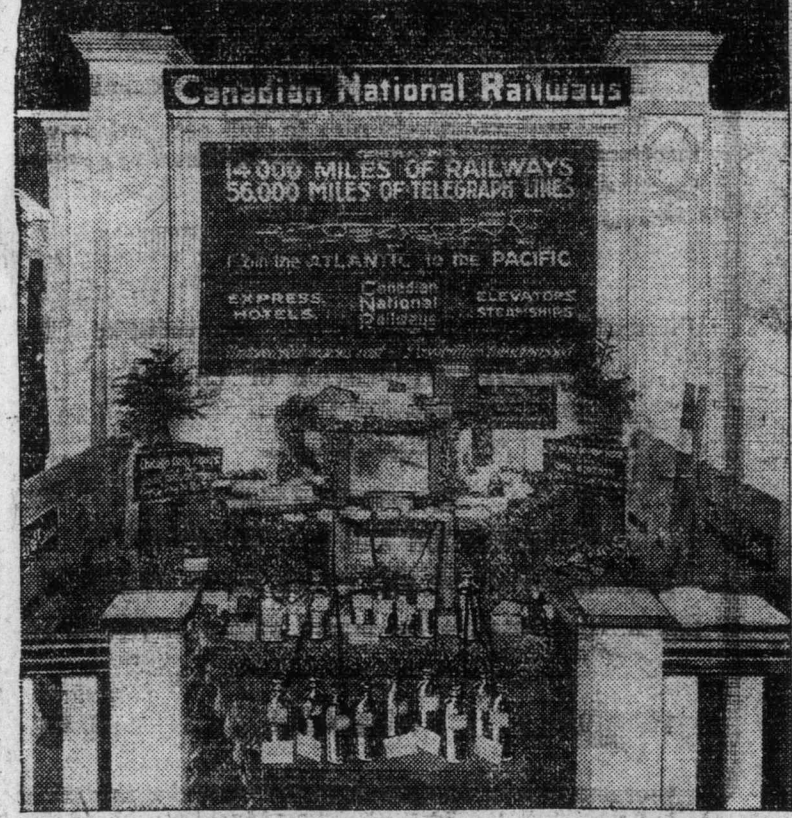
Canada at the National Chemical Exposition, Chicago.