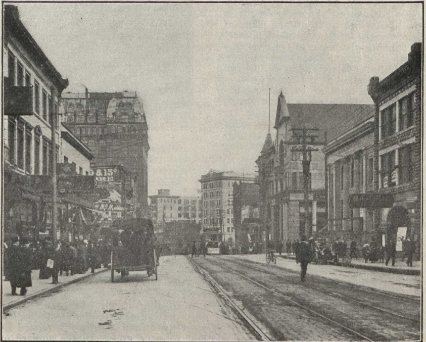
In the great timber Province—Hastings Street, Vancouver.