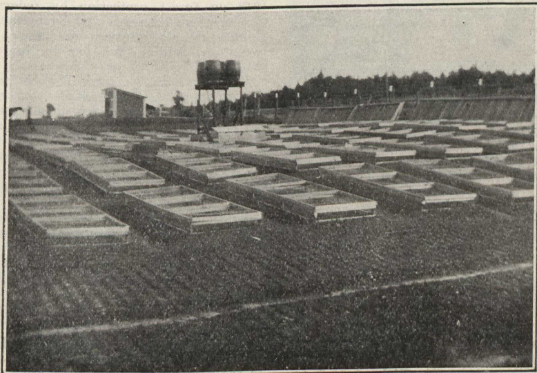
Another view of the nurseries at Cookshire, Quebec.

The close supervision now being given to the game side of forestry in Ontario was indicated by the arrest and dismissal of a game warden for breaking the law by having skins illegally in his possession. He was fined $450 for the offence.