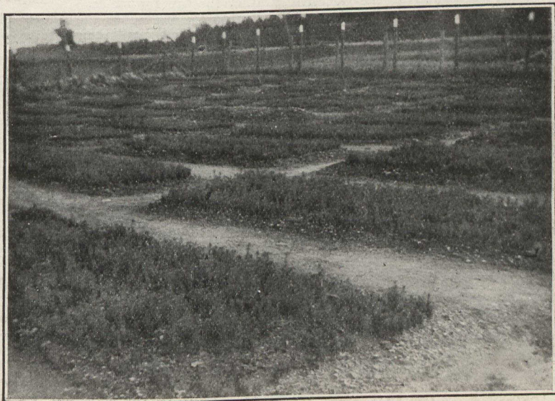
Nurseries of the Pejepsco Company at Cookshire, Quebec.

manent plantations with some of the two year old seedlings as an experiment this spring, but generally it is expected that the plan of allowing these seedlings to remain two years in nursery rows before planting out will be followed. While the company's plans are not matured it is generally understood that it is the intention to raise a moderate amount of seedlings each year for reforesting vacant and cutover lands on the company's holdings. The pictures herewith show the seed beds in the nursery at Cookshire, Quebec.