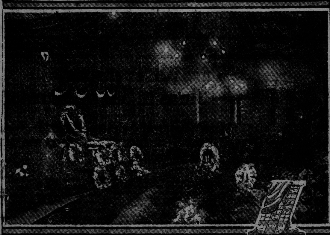
Scene in the Legislative Council Chamber at Halifax. The round canopy is the tribute from the Dominion of Canada.