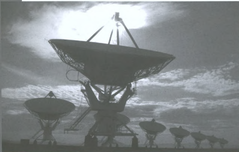
Satellites, whether for military or civilian use, require export permits.

Do you need an export permit for your product? This is a key question that's often overlooked. In fact, many Canadian exporters will only discover the answer when their product hits a roadblock at customs.