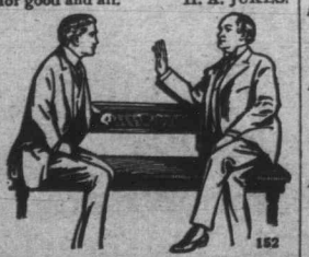
50c. a box—6 for $2.50—money back if not satisfied. Sample free by writing National Drug and Chemical Co. of Canada, Limited, Toronto.