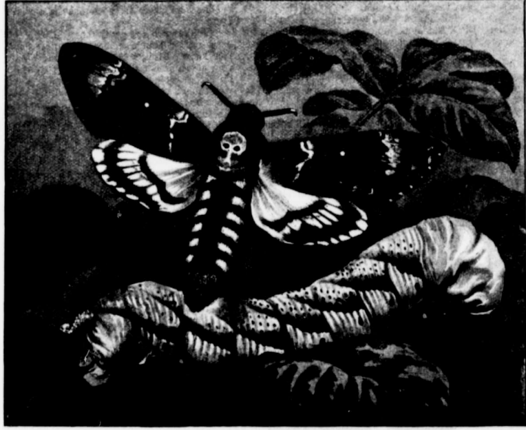
DEATH'S HEAD MOTH AND LARVA.

I hoped to feed and tame this curious sphinx, but it would not partake of any kind of food, not even honey, which is said to be so attractive to this species of moth as to lead it to force its way into