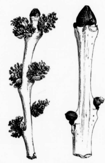
FLOWERS OF ASH.

We may easily distinguish the two kinds of catkins on the birch; the pistil bearing flower is small and upright, whilst the male catkin hangs down and bears the pollen in its bracts. Towards the autumn we shall find the small catkin, which is now erect, will have become