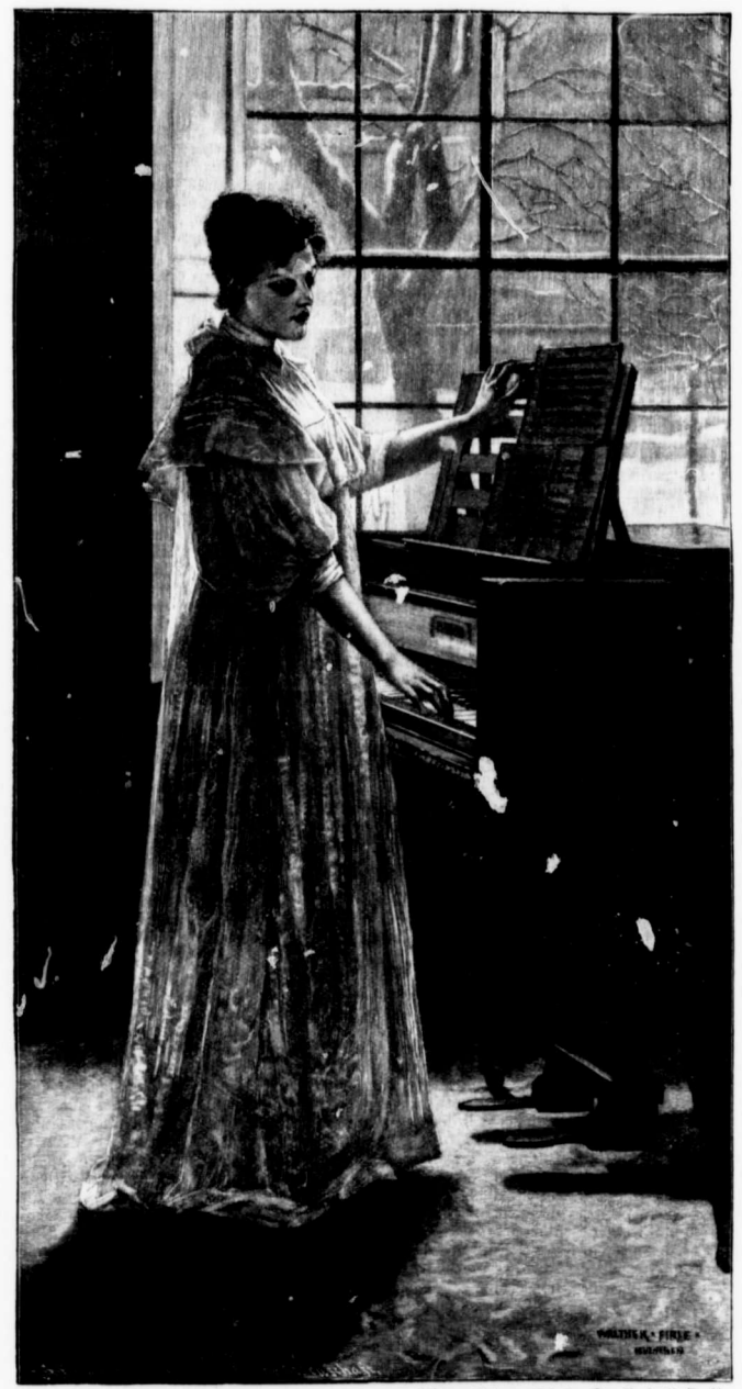
A SONG.