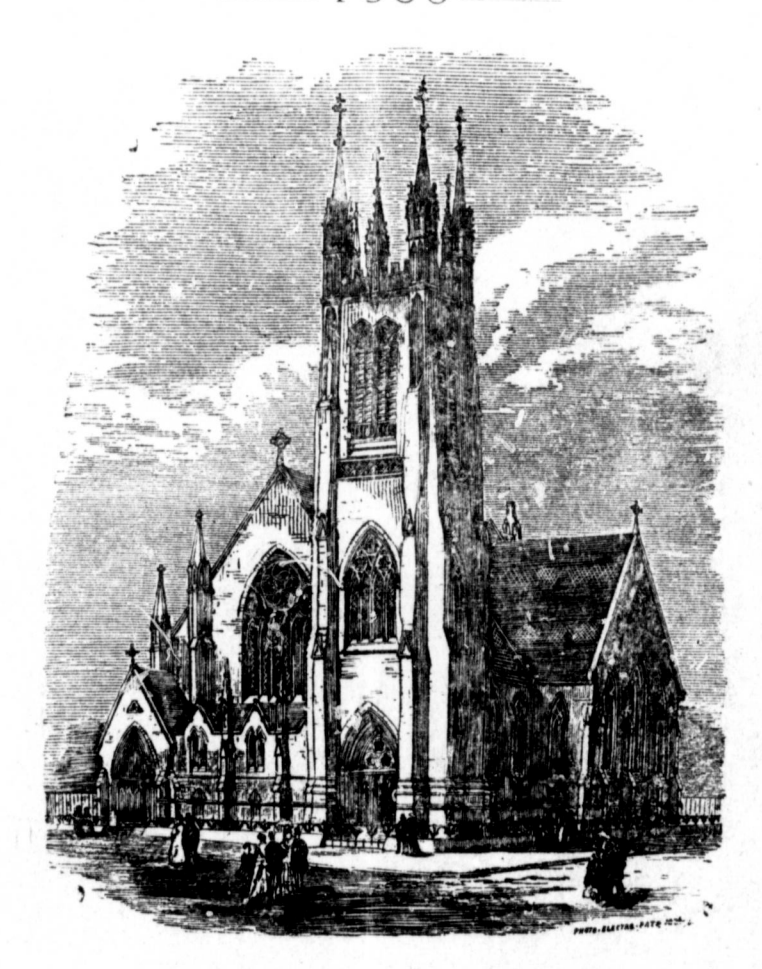
ST. PAUL'S CHURCH, MONTREAL.