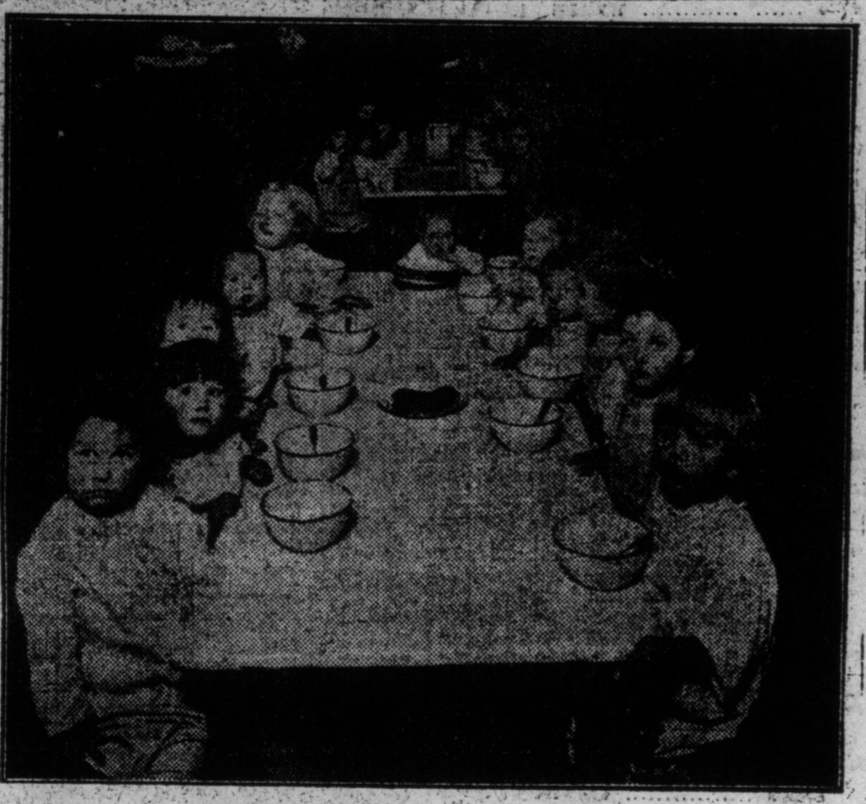
BREAKFAST AT THE INFANTS' HOME. Gathered about the board are a few of the children this worthy organization is endeavoring under heavy handicap to care for.

BOSTON, Dec. 22.—(Can. Press).—A bill for the dissolution of the United Shoe Machinery Co., a corporation of world-wide fame, was introduced by the federal government.