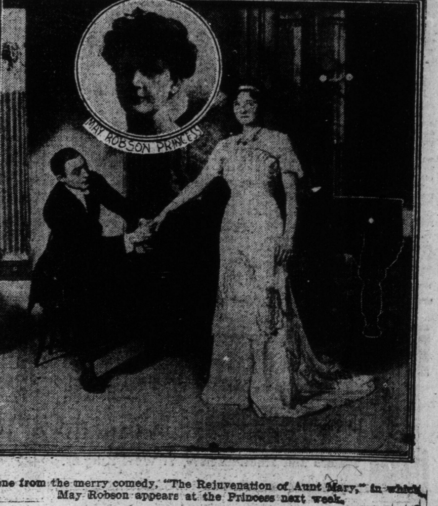
Scene from the merry comedy, "The Rejuvenation of Aunt Mary," in which May Robson appears at the Princess next week.

The Russell Motor Car Company are making a heavy shipment to Australia by each month's boat leaving the Atlantic seaboard, and according to information given out at the plant in West Toronto, new orders are being received as fast as existing ones are filled.