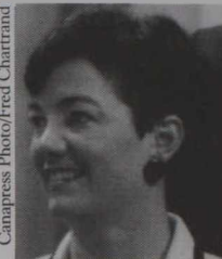
Sheila Copps Deputy Prime Minister and Environment Minister.

The Deputy Prime Minister acts for the government in the absence of the Prime Minister, for example, during Question Period in Parliament. Copps, 40, has been the Member of Parliament for Hamilton (East), Ontario, since 1984 and before that was a member of the Ontario legislature. While the Liberals were in Opposition, she held the posts of environment critic and co-critic for social policy. A candidate for the Liberal Party leadership in 1990, she became Deputy Leader of the Opposition in January 1991. Copps has said that cleanup and protection of the Great Lakes will be the government's highest environmental priority: "(The Great Lakes) will be the flagship of our environmental agenda and it will be the agenda by which we are judged," she said in November at a conference on cleaning up Hamilton Harbour.