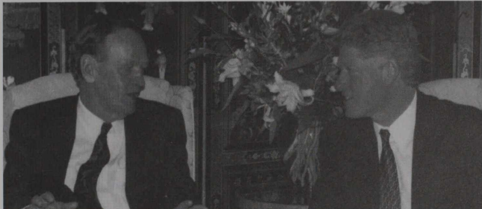
Prime Minister Jean Chrétien and President Bill Clinton in Seattle on November 18.

The Prime Minister noted that "we wanted to negotiate some improvements to NAFTA if we were to proclaim"