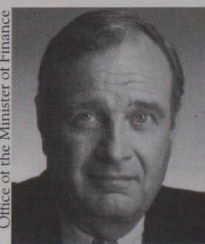
Paul Martin Minister of Finance.

The son of a long-time Liberal cabinet minister, Martin, 55, was first elected to Parliament from Montreal in 1988. He was a candidate for the Liberal Party leadership in 1990 and was co-author of the 1993 Liberal platform. Before entering politics, he was chairman and CEO of Canada Steamship Lines, Inc., which became Canada's largest private transport concern under his leadership. In addition to holding the Finance portfolio, he will have responsibility for the federal Quebec regional development agency. In his second week in office, Martin reaffirmed the government's "double-track" economic strategy: "The fact is that the root cause of the problem of the deficit is the weakness of the economy, and while we are going to have to clearly look line by line at all government expenditures, at the same time we are going to have to create jobs in this country and provide hope."