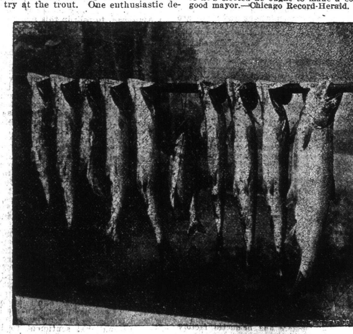
RESULT OF TWO HOURS' TROLLING BY THE STRAITS NEAR VICTORIA.