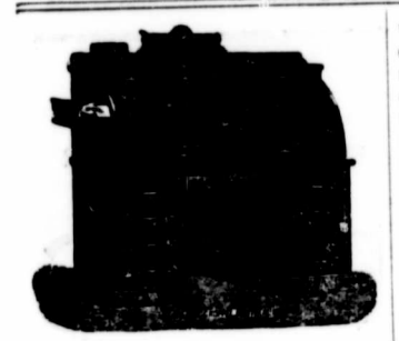
TEES & CO.,