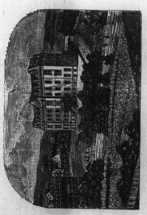
MOUNT ALLISON WESLEYAN MALE ACADEMY.