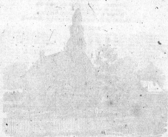
SEVERAL CHURCHES IN THE TOWN