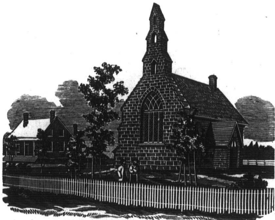
CHURCH AND PARSONAGE, SABREVOIS.