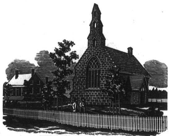
CHURCH AND PARSONAGE, SABREVOIS.