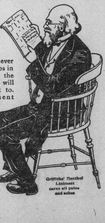
Griffiths' Menthol Liniment cures all pains and aches.