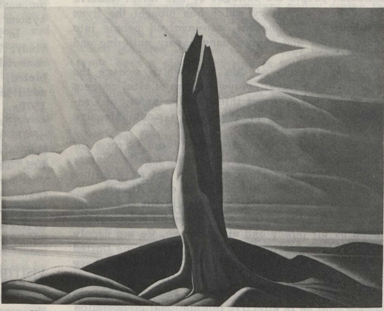
North Shore, Lake Superior