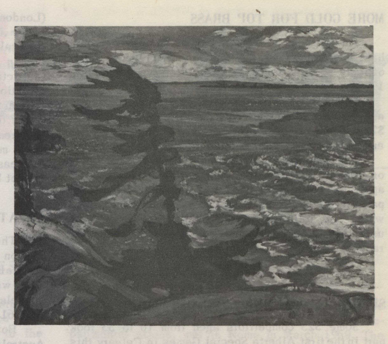
Stormy Weather, Georgian Bay F.H. Varley