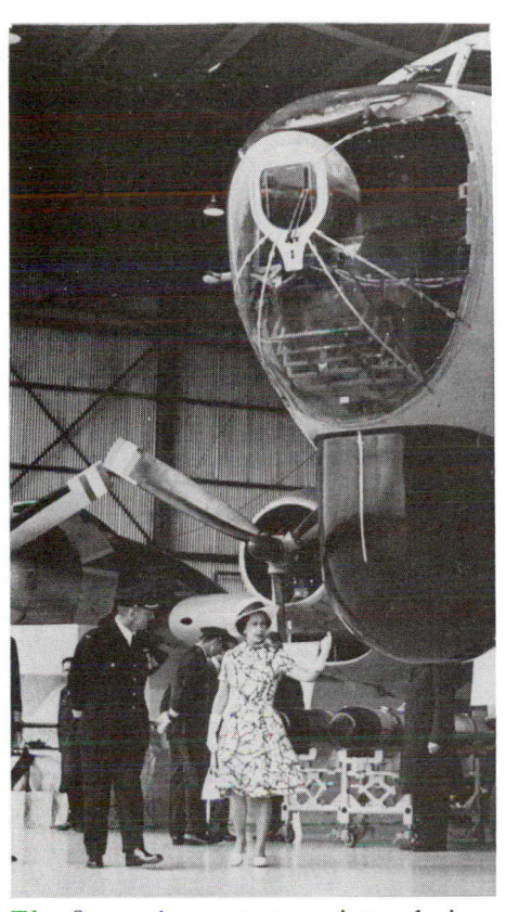
The Queen inspects a variety of airrescue planes and equipment at Canadian Forces Base, Summerside, P.E.I. on July 2.

Franche de la Marine and the 78th Fraser Highlanders. At Summerside, before a crowd of 8,000, the Queen opened the Centennial Summer Games.