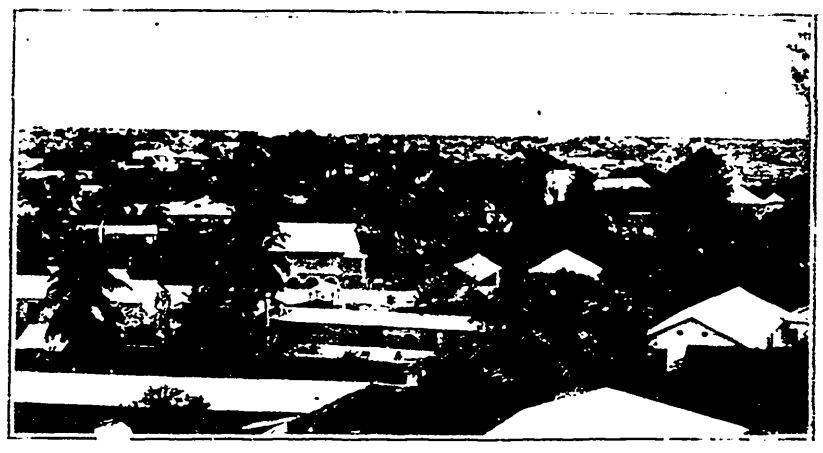
A VIEW OF LAGOS-WEST COAST OF AFRICA.