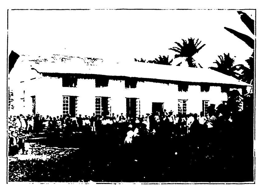
THE BAPTIST CHURCH AT KAMERUNS, AFRICA.

This church is entirely independent and maintains twenty-seven outposts. The bricks were made and the building creeted entirely by native Christians.