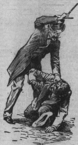
It's you, is it? And this is the second time I've caught you spying."

Nuggets of Gold are now being panned out in the newly discovered PLACER GOLD FIELDS of Washington. Immensely rich. Paying $50 to $750 per day. Secure an interest. Particulars free. British-Canadian Investment and M. Syn. Box 982 Spokane, Wash. A & O July 31