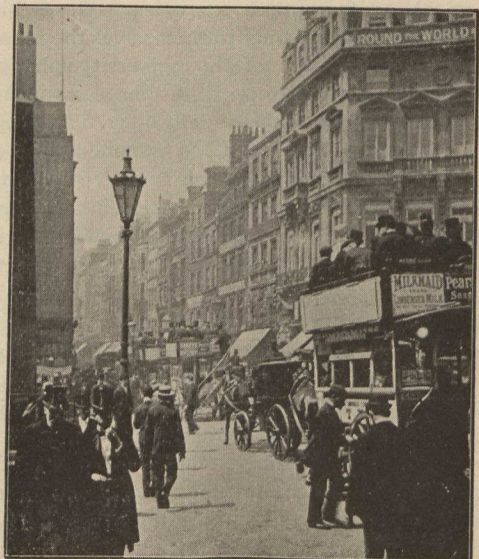
HOLBORN CIRCUS, LONDON.

Oh, what a civilization! Who is responsible for the tragic inequalities of destitution and irresponsible wealth? What new comer will evolve from it a