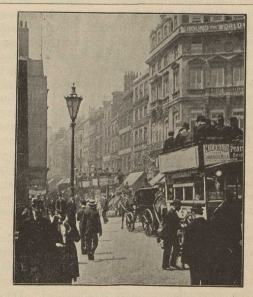
HOLBORN CIRCUS, LONDON.

Oh, what a civilization! Who is responsible for the tragic inequalities of destitution and irresponsible wealth? What new comer will evolve from it a