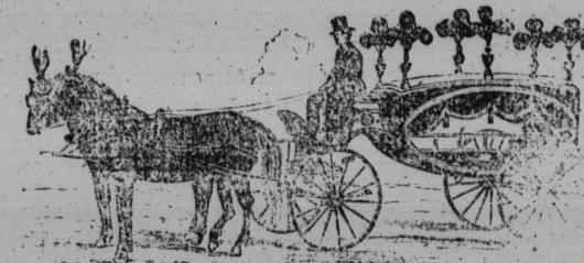
(Cut of our new Hearse.)