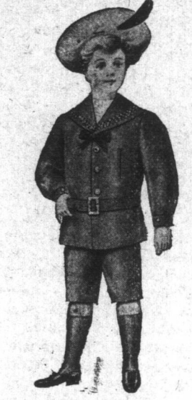
The " CORNWALL."

Boys' 2-piece Sailor Suits, made of fine and coarse serges, with patch pocket, pants have straight cut knees, same as cut above; sizes 000 to 4. Prices 65c. to $3.60 suit.