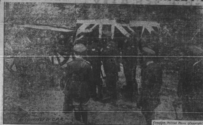
. Funeral of General Lipsett near the lines. Taking the coffin from the gun carriage. H.R.H.