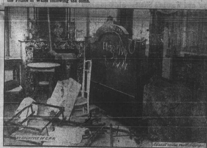
"Got Mit Uns": This German hall mark chalked by one of the Cambrai vandals on the bed-stead of a pillaged room is a good example of German humor.