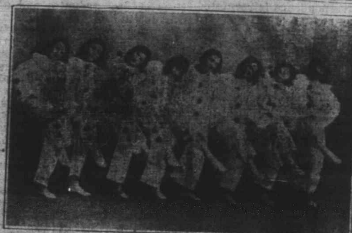
Scene from Rossley's Big Musical Comedy Co. of 25 artists appearing at the Nicklet Theatre all this week, with a change of programme each night. To the big musical show is added an excellent bill of motion pictures. The prices are 10c, 20c, Reserved 30c. Two and a half hours solid performance—No repeats. MATINEE ON SATURDAY AFTERNOON AT 3.30.

Don't forget the Place — Cornwallis St. KENTVILLE.