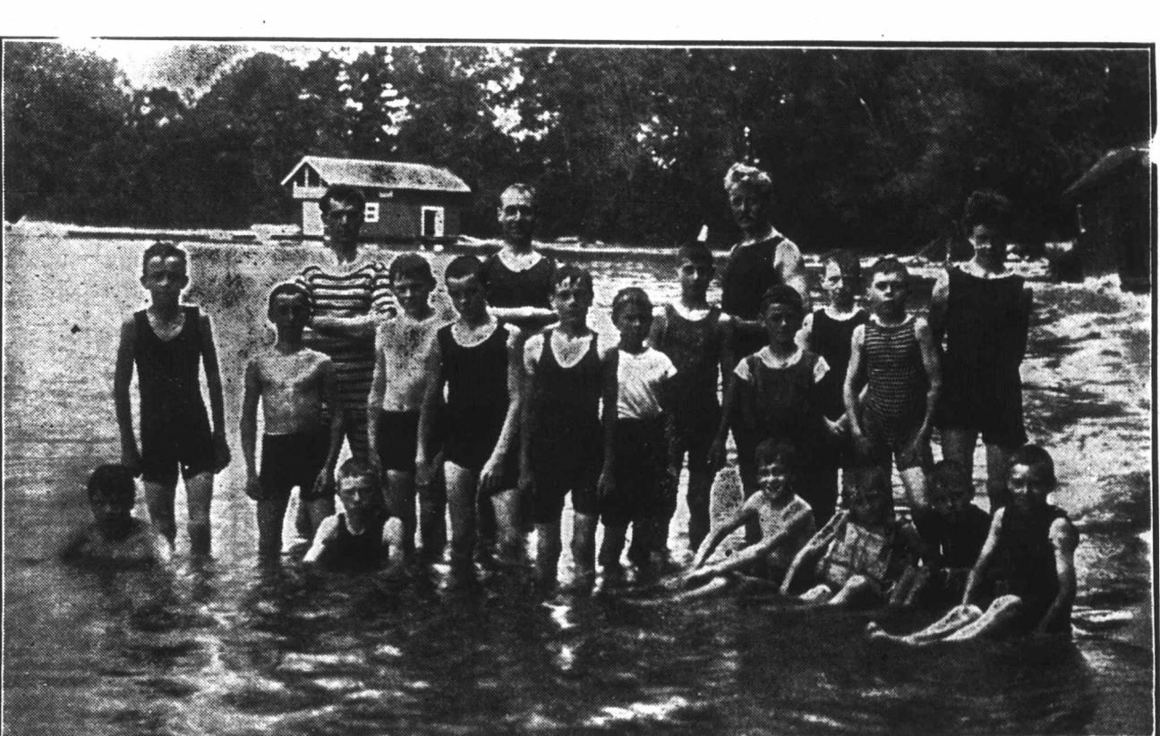
ON A WARM SUMMER DAY.

discipline, and if necessary, will be returned home, in which case no fees will be returned.