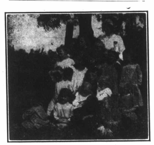
THE LITTLE GIRLS' TURN. ("Anglicans in Camp," see page 409)

"It is the beautifulest thing I ever saw," she said, and when she went