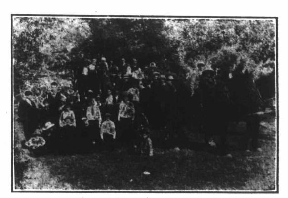
A LOAD OF FUN-

for outdoor life as a stimulus to a higher life. A summer camp may be a blessing or not. The Anglican Camps at Gamebridge Beach are striving to be a blessing.