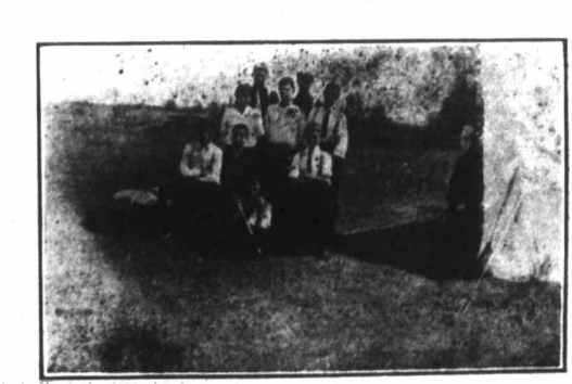
READY FOR THE FINAL.

Perhaps you have not the guest, but the money? We will be pleased to take the money. Can we help you in your work? Can you help us? Address communications to 110 Beverley Street.