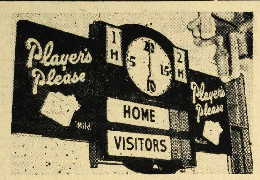
NEW GYMNASIUM CLOCK - Know The Score -

Tickets will be on sale shortly, and the privilege of sitting out dances in the Gazette office is reserved for the editoral staff.... and fiends.