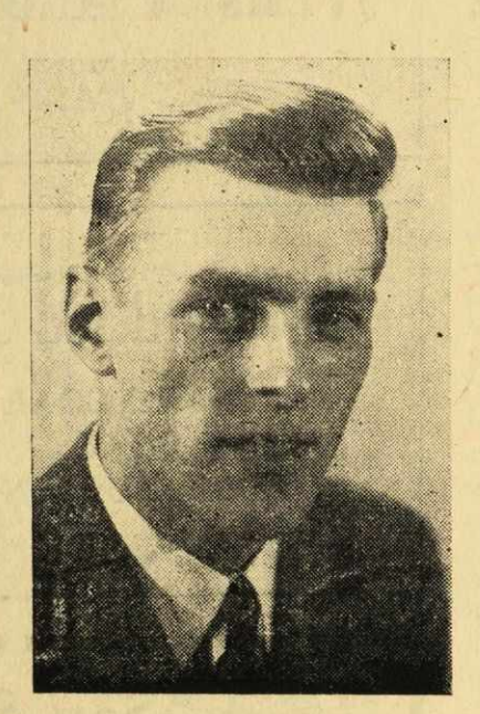
FARQUHAR - Returned -