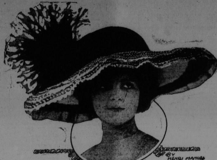
This attractive new French model, the photograph of which has just arrived from Paris, is made up in black satin—broad-brimmed, low-crowned and aligrette-trimmed. A new touch is the double ruffle of the finest of white laces about the brim edge. The brim is faced with white satin.