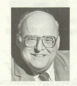
Sen. Gérald Beaudoin