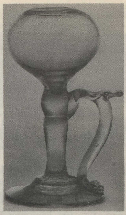
Whale oil hand-lamp