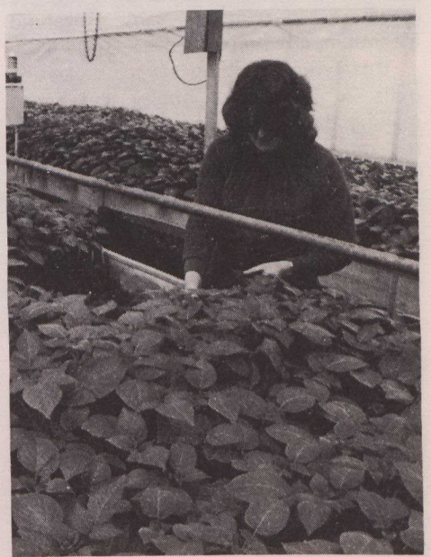
Agriculture Canada's seed potato potential program is helping expand exports of Canadian seed potatoes. The program aids development of new varieties such as these being grown at a seed farm run by the Prince Edward Island Potato Marketing Board.

Caribe is a high-yielding, purple-skinned potato that matures early. These characteristics make it ideal for Cuba and possibly other countries in South America and the Caribbean. This variety has proven to be an excellent seed producer in tests carried out in the Atlantic provinces. Tests of Canadian potato varieties are also under way in Uruguay, Argentina and Brazil.