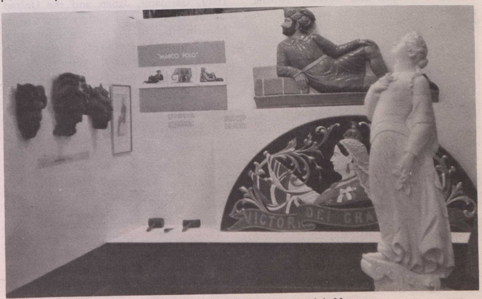
Wood sculptures in the marine gallery of the New Brunswick Museum.

The museum also has furniture of the Loyalist period and silverware produced by New Brunswick silversmiths at the turn of the century.