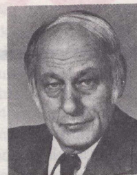
René Lévesque Quebec