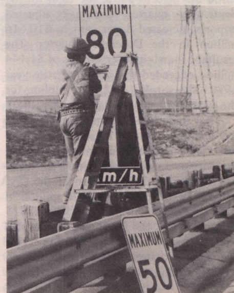
Something new has been added to Ontario's highways — speed and distance signs expressed in kilometres to replace miles as shown above.

As the next step in the conversion from imperial to metric measurement, Metric Commission Canada is encouraging provincial governments to post highway speeds and distances in metric figures. Wary drivers seeking methods of adapting to confusing road signs are being taught to