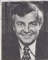
Peter Lougheed Alberta