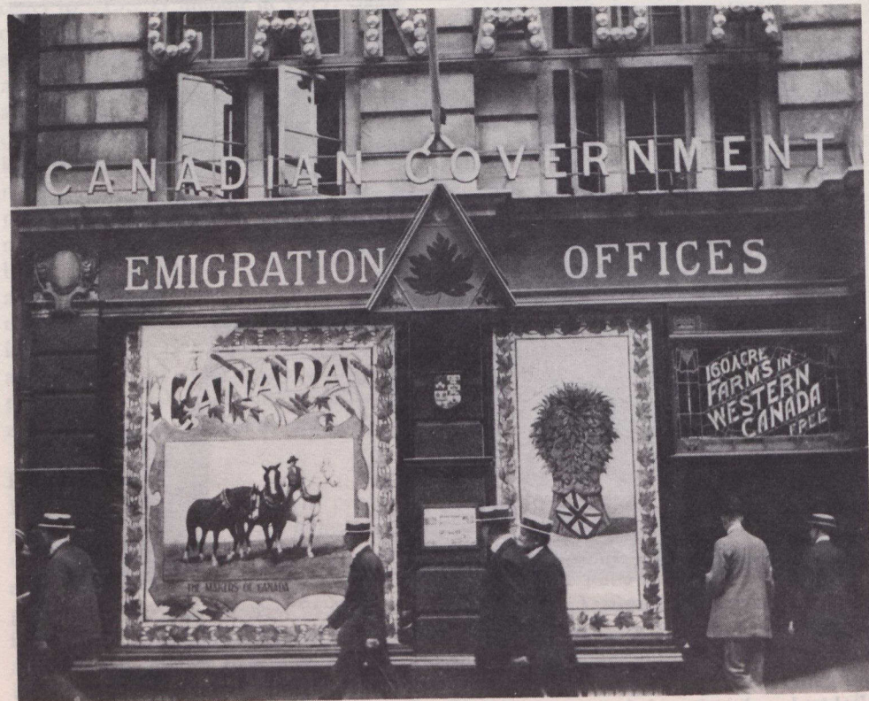
To populate western Saskatchewan and Alberta, the Department of the Interior lured immigrants with posters, lectures and emigration offices in the European capitals.

From there my father and I were booked through to Brandon where we were hired to a farmer to learn the rudiments of farming at a wage of $10 a month each. After six weeks we moved further west to Girvin, a small town on the old Canadian National Railway, half way between Regina and Saskatoon. It was here that my mother, five brothers and sister arrived five months later.