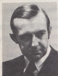
Richard Hatfield New Brunswick