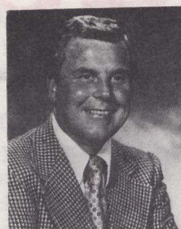
Sterling Lyon Manitoba