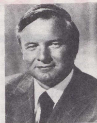
William Davis Ontario