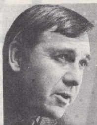
Allan Blakeney Saskatchewan