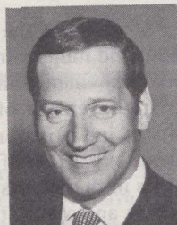
Gerald Regan Nova Scotia