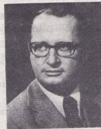
Frank Moores Newfoundland

research and development. The Ministers agreed to collaborate in accelerating major energy developments, wherever possible.