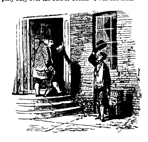
BIBLE QUESTIONS ABOUT DOORS.

"Here are a few Bible questions to keep my Try Coupany busy over the best of books. I will call them