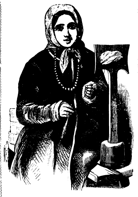
For the Sunday School Advocate,

A TEACHABLE SPIRIT.—A sensible little boy, when one day asked whether he should not like to teach a class of Sunday-scholars, wisely and humbly said, "I had rather be taught."