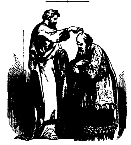
From the "Sunday-School Almanac."

good everything was, and how I loved everybody. { side of the cat, when a little clucking, and growling, and snapping, and purring, and general uneasiness followed, and a kind of compromise was effected and perfect quiet restored. After that the hen came every day at the usual hour and deposited her egg in the nest by the side of the cat that occupied the same nest with her young.