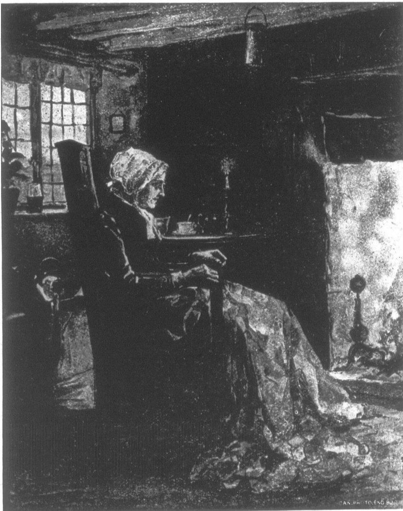
The Canadian Churchman.

A season of soft sounds and hues, Of twilight walks among the dews, Of feelings calm and converse blest, And thoughts too big to be expressed.