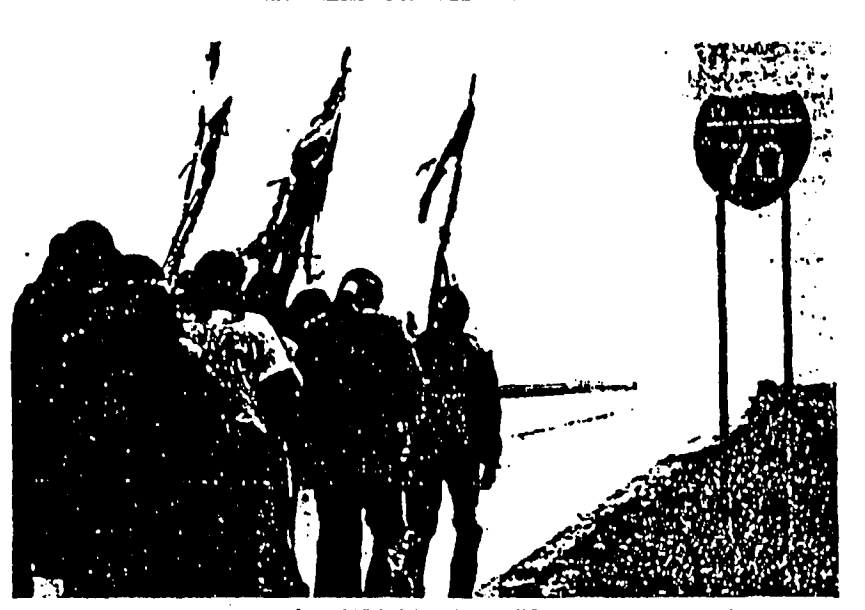
Longest Walk for Indian rights, 1978, U.S.