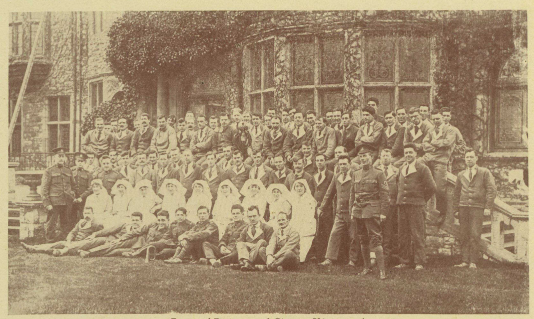
Group of Patients and Sisters, Kingswood.

After tea there were more competitions, followed by songs and conjuring tricks by some of the patients on the lawn. The songs (quite exclusive), mouth organ solos, and various