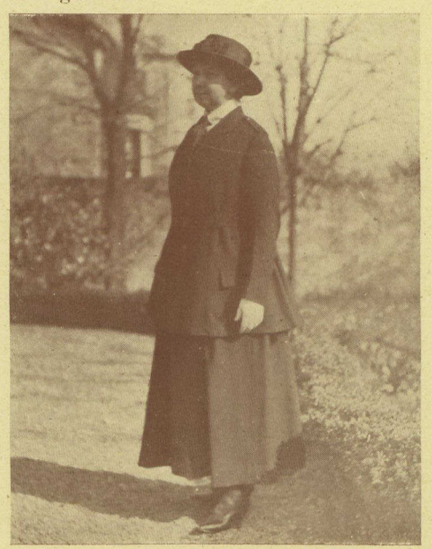
Kingswood Matron in Outdoor Uniform.