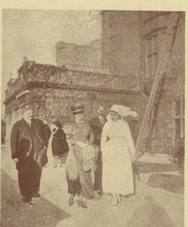
Princess Alice of Teck, visiting Kingswood.

The weather during June was very sunny and fine, so that the patients were able to take full advantage of their stay in the Home, the cripples by exercise in the grounds, and those who are more active by walks and excursions in the surrounding neighborhood. July was exceptionally wet and cold, but on the days when the weather was too unfavorable for the men to get out of doors much, there was always