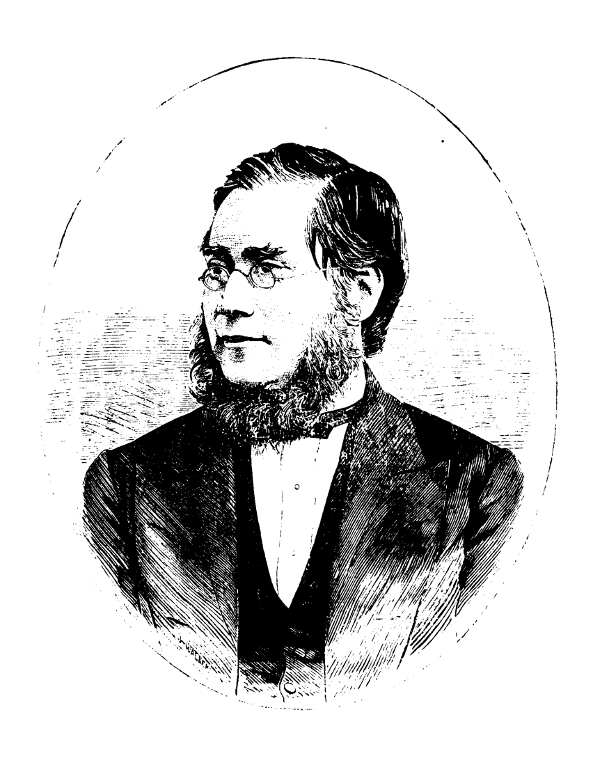
HON. OLIVER MOWAT.