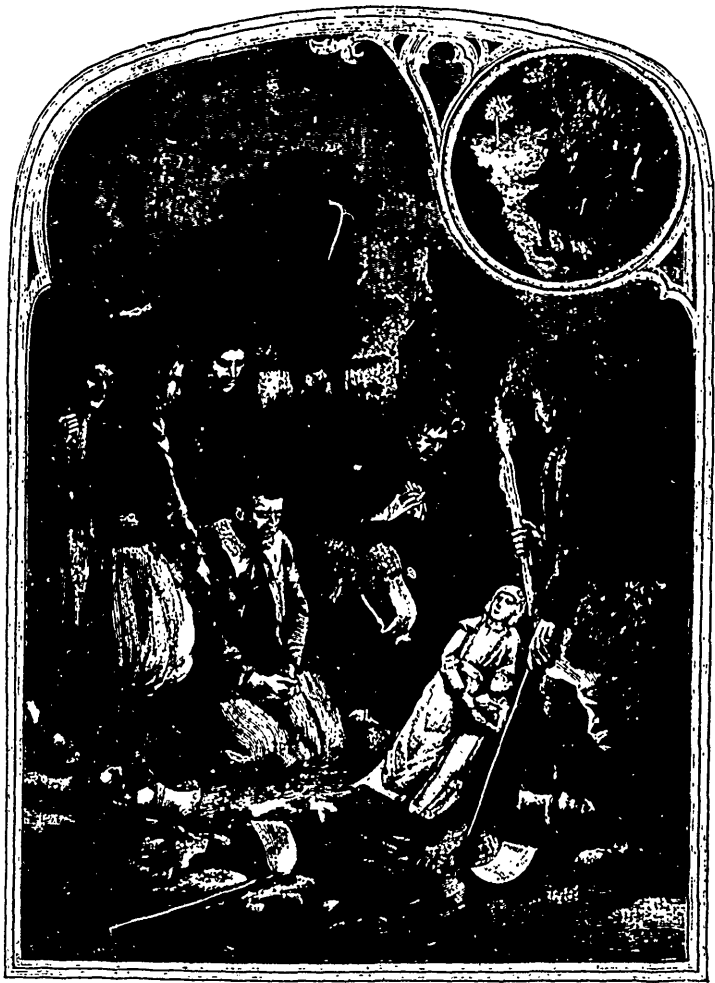
Nicolazic discovers the Statue of St. Anne d'Auray