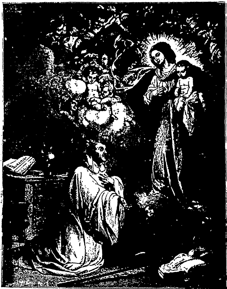
Apparition of the Blessed Virgin to St Bernard